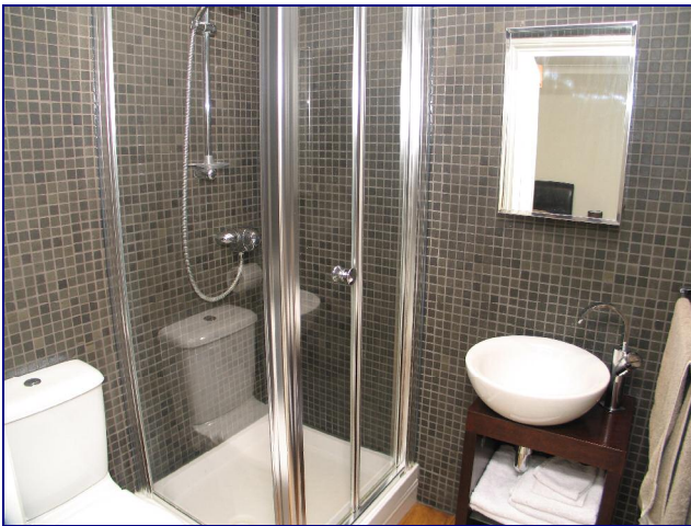
En-suite Shower room

EN-SUITE SHOWER ROOM [5' 7" x 4' 8" (1.7m x 1.42m)] very attractively presented with corner shower cubicle with Triton shower fitting, circular bowl wash hand basin with mixer tap set on a wash stand with glazed shelf, low level WC, Oak floor covering, mosaic tiling to full height on all walls, wall mounted toiletry cabinet, radiator, inset ceiling spot light fittings and extractor unit.